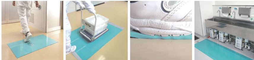
In front and behind of clean room.